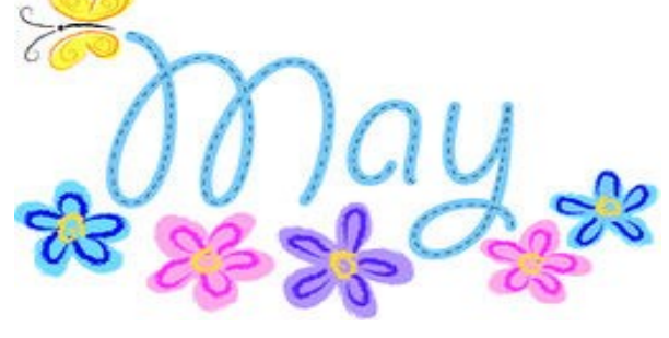
Dates to Remember